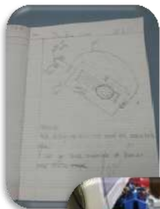
Pictured: Our D + T instrument projects – the planning and construction phases. Stay ‘tuned’ for the finished product!

Our Design and Technology focus has shared a link to my passion of music. Students are in the process of conceptualising, constructing and presenting their own musical instrument made from only recycled materials. The task design process has been very thorough, with students coming up with a unique name for their instrument, drawing and labelling a final-piece diagram, comprehensively listing their chosen materials, as well as outlining where they will get these from. Many thanks to the families that have supported with providing recycled materials during this process. The students are absolutely loving this, and they are coming to school itching to resume the construction process before the 8:50am bell has even rung!