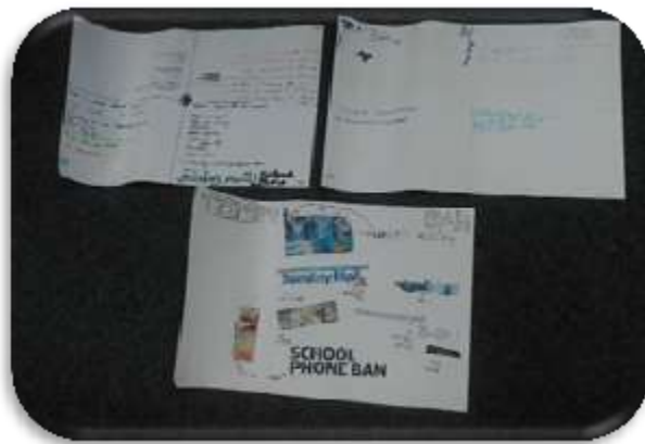
Pictured: Just some of our classroom work where we have been analysing the features and structure of a factual recount.

Our Design and Technology focus has shared a link to my passion of music. Students are in the process of conceptualising, constructing and presenting their own musical instrument made from only recycled materials. The task design process has been very thorough, with students coming up with a unique name for their instrument, drawing and labelling a final-piece diagram, comprehensively listing their chosen materials, as well as outlining where they will get these from. Many thanks to the families that have supported with providing recycled materials during this process. The students are absolutely loving this, and they are coming to school itching to resume the construction process before the 8:50am bell has even rung!