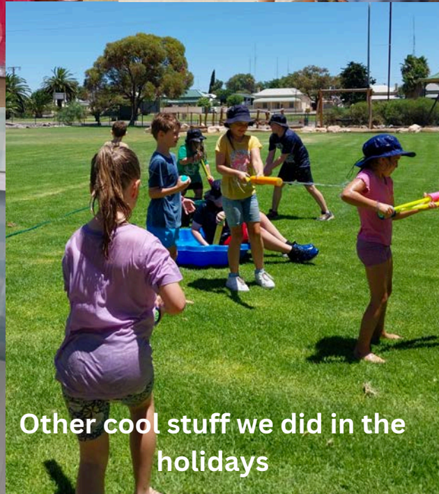
Other cool stuff we did in the holidays